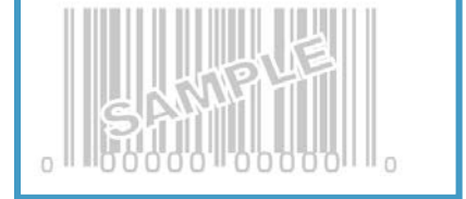
Example of the UPC Code